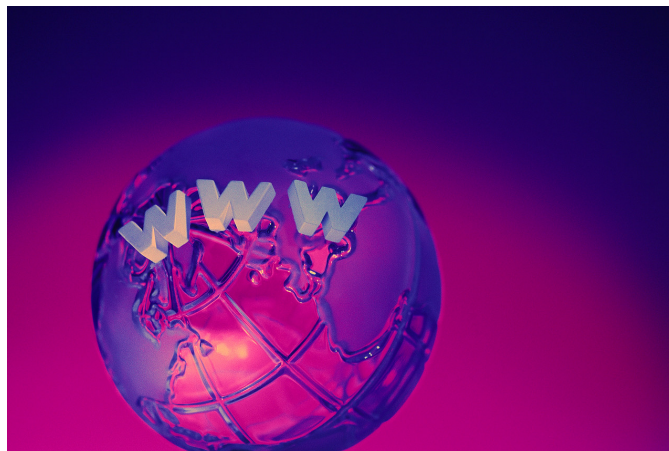
Figure 1. Figure captions are indented 5 spaces and justified. If you are familiar with Word styles, you can insert a field code called Seq figure which automatically numbers your figures.

Figures are centered. Use or insert .jpg, .tiff, or .gif illustrations instead of PowerPoint or graphic constructions. Captions go below figures. Indent 5 spaces from left margin and justify.